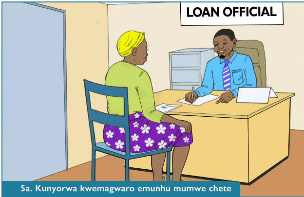
5a. Kunyorwa kwemagwaro emunhu mumwe chete

The U.S. Government's Global Hunger & Food Security Initiative