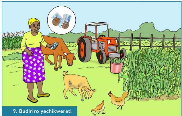
9. Budiro yechikwereti