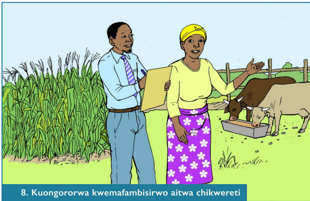
8. Kuongorwa kwemafambisirwo aitwa chikwereti