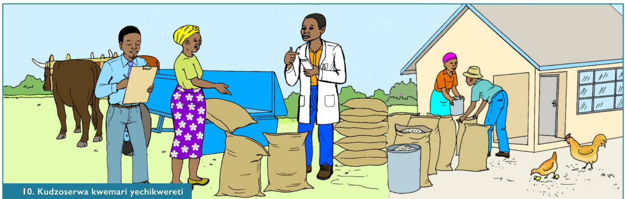
10. Kudzoserwa kwemari yechikwereti