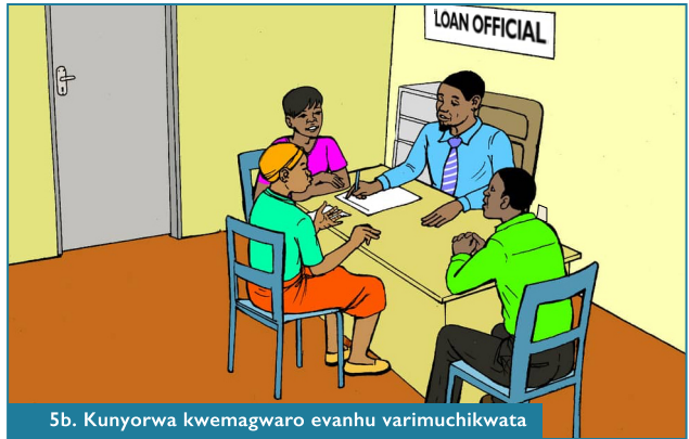
5b. Kunyorwa kwemagwaro evanhu varimuchikwata